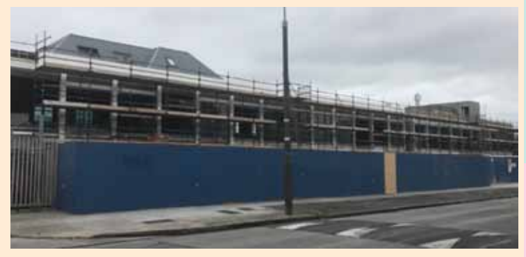
The Family 'Hub' at Greencastle Rd., Coolock

Edenmore Boxing Club: Representations have been continuing to assist Edenmore Boxing Club to source an appropriate permanent facility.