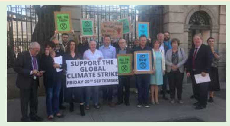
Tommy supporting the Climate Strike

Saving St. Columbanus Hall, Howth: Parish representatives have been meeting the Howth Sutton and District Community Centre Committee regarding a possible sale to, or acquisition by, the local community of the historic St. Columbanus Hall. Deputy Broughan has raised the importance for public retention of St. Columbanus Hall with Community Minister Ring.