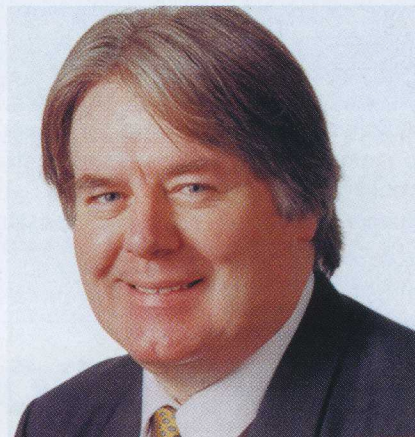
Tommy Broughan TD

Labour Deputy Tommy Broughan has urged significant new investment in the health, education and transport infrastructure of Dublin North East. Deputy Broughan commented, "With the massive development now taking place in the North Fringe district in Dublin North East and other significant new housing developments across our community, it is vital that essential services in health, childcare, education and transport are in place for all residents of Dublin North East. That is why I have put forward the following four proposals to ensure that critical services will be available as our community expands and develops: