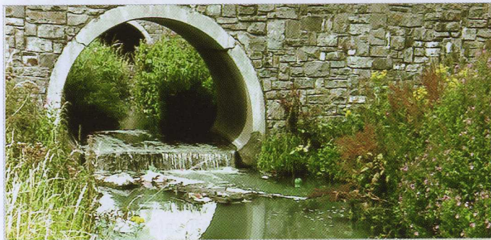
Serious Pollution at Stardust Memorial Park