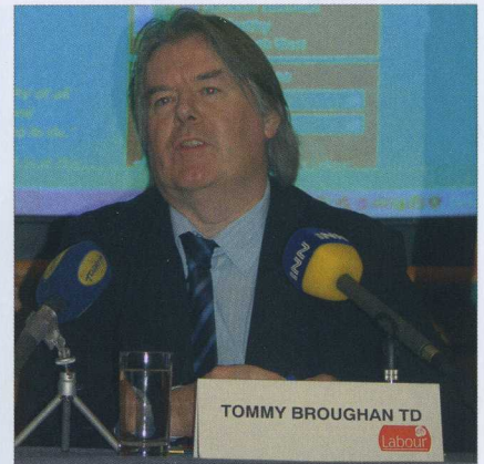
Tommy Broughan TD launches Labour's new website

This innovative scheme will enable people to start purchasing a home as soon as they are in full time employment and allow them to increase their equity in the home as their incomes increase and financial circumstances improve. Labour is also committed to introducing new tenant purchase schemes for local authority tenants and tenants of voluntary and co-operative housing bodies.