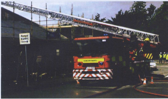
Firefighters at Kilbarrack United Clubhouse, Greendale Road