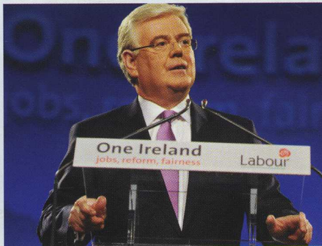
● Labour Leader Eamon Gilmore T.D.