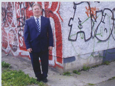
● Campaigning against Graffiti