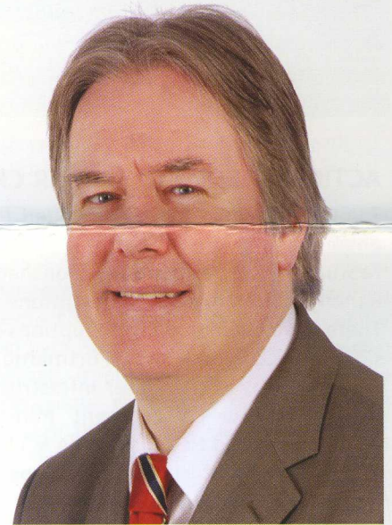
Tommy Broughan TD

The bailout of dead banks by the Fianna Fail/Green government continues to haemorrhage billions of euros at the same time as families across Ireland suffer an unbearable burden of cutbacks and massive debt. €22 billion of public money may be pumped into Anglo Irish Bank alone because of the government's blanket bank guarantee which the Labour Party stood alone in opposing in September 2008 in Dáil Éireann. So for at least the next ten years the Irish government will take €2 billion out of the budget each year just to keep this one casino bank afloat.