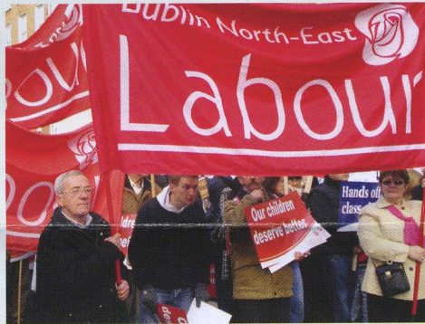
● Labour on the march.